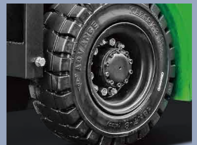
Standard rubber tread tires