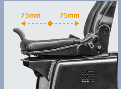
Seat can be adjusted backwards and forwards