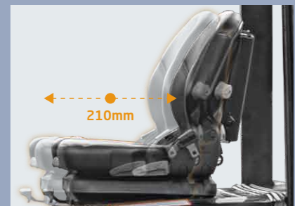
The seat can be adjusted back and forth by 210mm. The operator can choose the best driving position