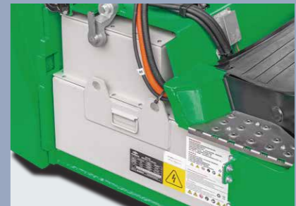
The packs can be easily removed by a manual or electric cart, and can be repaired and maintained conveniently